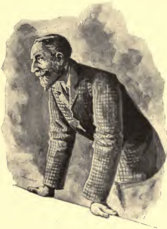
The obliging ironmonger.

“I have a pair of real little beauties,” went on